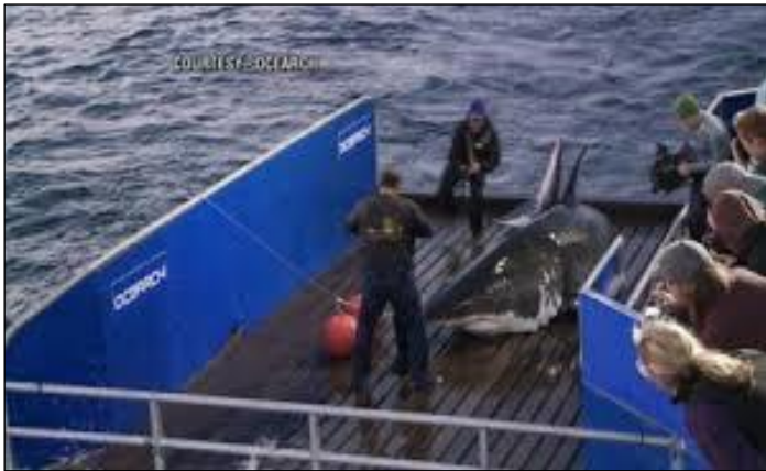
Mary Lee aboard OCEARCH ship

Maybe you've read about it in the newspaper or saw it on TV. A Great White Shark named Mary Lee was tracked into Chincoteague Bay on May 5th (or Cinco de Mayo for all you Margarita lovers). The group, OCEARCH, tags and tracks sharks around the world. A 'ping' is received every time Mary Lee's dorsal fin comes out of the water.