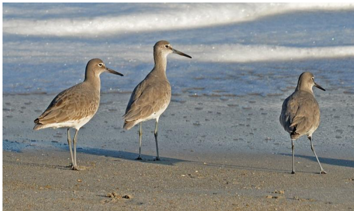
Willets Watching Waves

Have you seen the willets flying down by the shore with their distinctive white wing patches? Or heard the willets loud call? "Whatcha talkin bout Willets?" Just had to throw the Diff'rent Strokes reference in there.