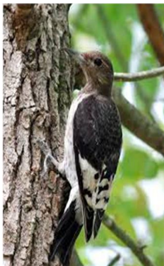
Immature red-headed woodpecker

The breeding pairs will create a nest in a dead tree, branch, stump, or even in a telephone pole or fence post, between 5 and 50 feet above the ground. The hole may be excavated by the woodpecker or may be an existing cavity. The cavity is usually about 6 inches wide by 8 inches deep with a 2 inch diameter entrance hole. A breeding pair of red-headed woodpeckers may use the same cavity over a number of years. The female will lay three or more eggs with the incubation period running about 14 days. The young can usually fledge within a month of birth. The pair may raise two broods each year.