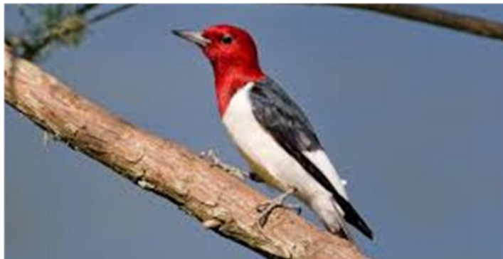
Adult red-headed woodpecker

On numerous visits to the community during the past few summers, I've spotted an adult red-headed woodpecker. I've seen the bird at the intersection of N. Hibiscus and Pine Tree Way. I've seen them along Pine Tree Way on the phone lines and telephone poles. On a recent visit, I saw a pair of red-headed woodpeckers as I was pulling into the driveway. But these looked different. From the neck down, they were definitely red-headed woodpeckers. But from the neck up was a grayish black. These were immature red-headed woodpeckers. So, there appears to be breeding red-headed woodpeckers in the neighborhood!